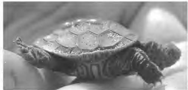
Fig. 1. Hatchling Malaclemys terrapin terrapin found on Fisherman Island, Virginia on 22 March 2005.

At approximately 1000 h EST on 22 March 2005, one of us (PD) found an active hatchling M. t. terrapin (Fig. 1) walking along the beach access road on Fisherman Island, Eastern Shore of Virginia/Fisherman Island National Wildlife Refuge, Northampton County, Virginia (37° 05' 52.17" N, 75° 58' 30.82" W). The turtle lacked any growth marks on the carapacial scutes supporting our identification of a hatchling stage (Fig. 1). The weather was sunny that day with a high of 10° C (at time of capture) and a low for the previous night of 0° C. Rain in the previous 24 h was 0.25 cm. PD first saw the turtle's tracks and followed them to the hatchling. No other turtles were seen despite additional searching. Nesting females use this area regularly.